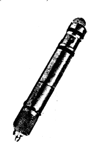
Figure 2. Retaining Ring Installed in Tool

Install lubricating tool as shown in Figures 2-34 and lubricate with Multipurpose Lubricant (C-92-63250).