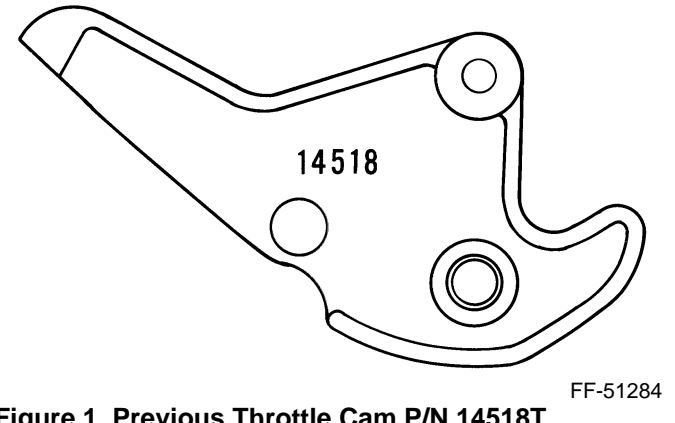
Figure 1. Previous Throttle Cam P/N 14518T