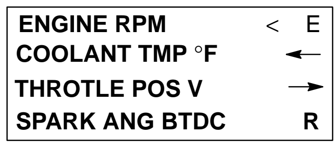
Figure 2. DDT Screen.

The Digital Diagnostic Terminal (DDT) may display a screen with no information (figure 2) when the unit is connected to the newer 824866—1 ECU (Quicksilver replacement p/n 824866A–1) even when the proper connections are made. This screen may appear when the ignition key is turned "ON" or the engine is started and running. This error is caused by the ECU not communicating with the DDT and the fix is easy.