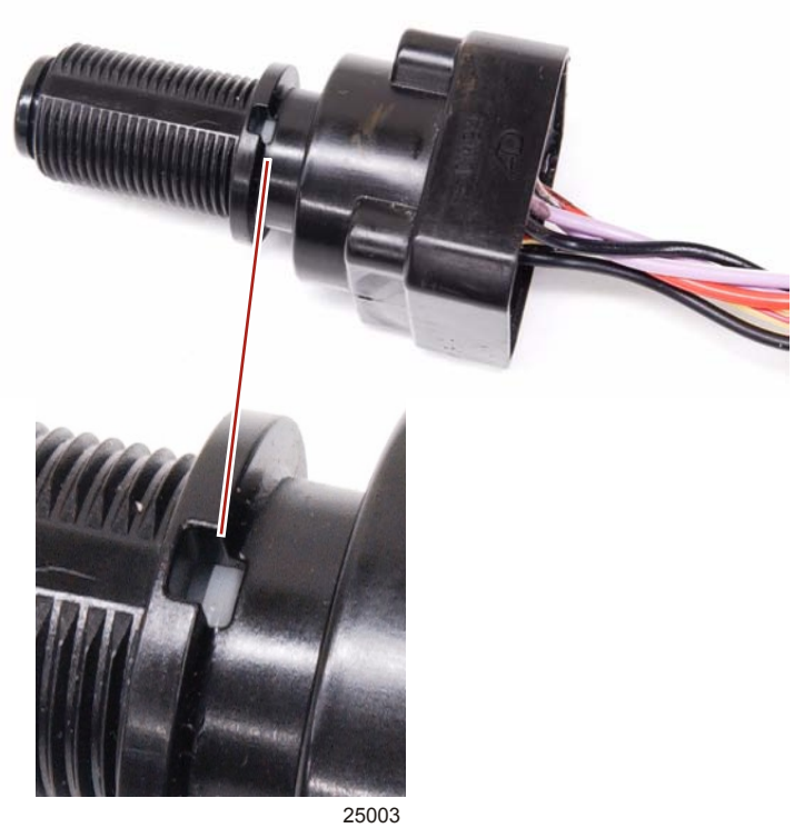
White plastic tumbler viewed through drain hole

NOTE: If the key switch has experienced a short circuit, it must be replaced and the new switch installed correctly.