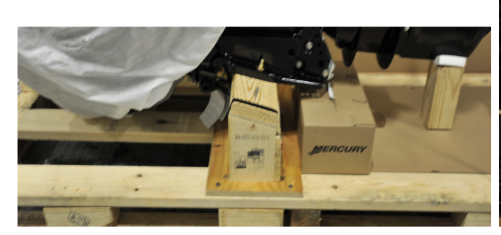
Overall engine condition