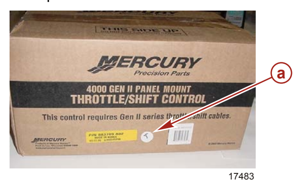
a - White dot with purple "T"

Remote controls in the parts inventory must be checked for the part numbers as listed on the first page of this bulletin. All remote controls in the original unopened carton WITHOUT a white round sticker with a purple colored "T" on the part number label must be returned to Mercury Marine for credit. The purple colored "T" in the white round sticker indicates that the control was inspected and is able to be sold.