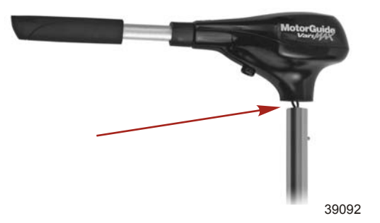
Top housing removed from column

2. Remove the top housing from the column. Do not remove the heat-sink grease on the motor.