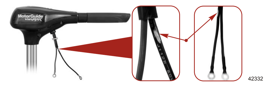
A white mark on the black power cable indicates a replacement top housing

NOTE: Do not attempt to service the top housing. Non-factory approved methods are unacceptable and the warranty claim will be denied.